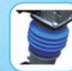
HIGH QUALITY BELLOWS