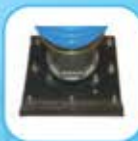
HEAVY DUTY FOOT