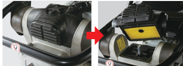
● Pre air-cleaner with Twin Cyclone