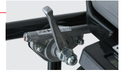
● MIKASA Original Throttle Lever