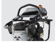
● VAS Handle