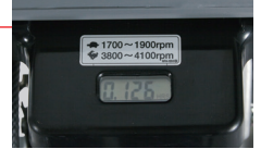
● Tacho Hour Meter