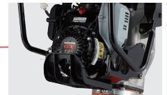
● Recoil Guard