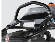
● Engine Cover